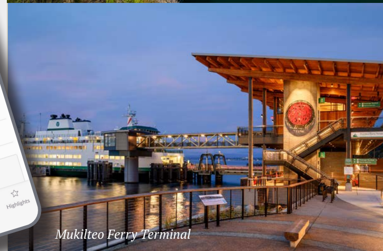
Mukilteo Ferry Terminal

Top Photo: Boundary Dam is located on the Pend Oreille River in northeastern Washington and is the largest underground power-generation dam in the nation, providing nearly 50% of the power generated by Seattle City Light. The project goal was to remove total dissolved gas modifications made in 2016 and restore the spillway to original conditions. Significant fall hazards required heightened safety precautions.