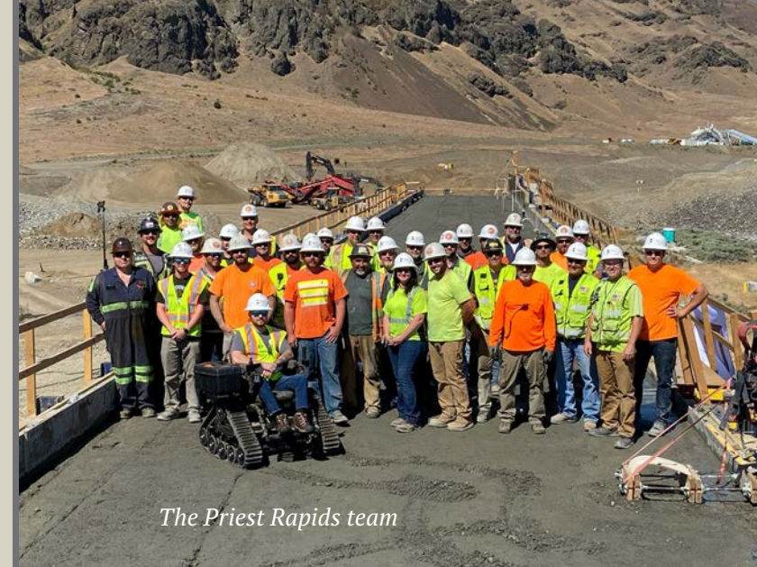
The Priest Rapids team

The project will be completed within 80 working days, with an estimated completion date of October 2022.